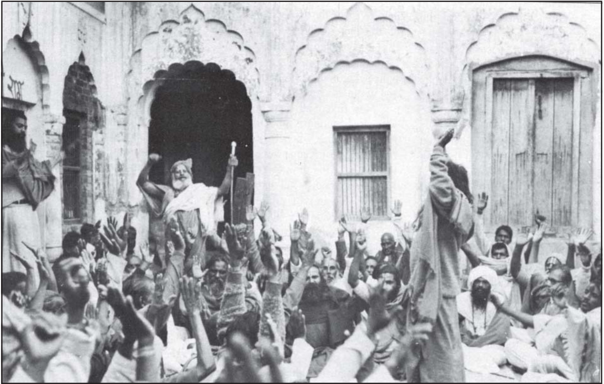
Pawns in the politicians game: a meeting of sadhus at Ayodhya

least a foot and a half high. A lantern had been lit and was hanging behind Ramsukh's head on one of the wooden poles holding up the roof of the hut. At some distance on his right an earthen oil lamp was burning.