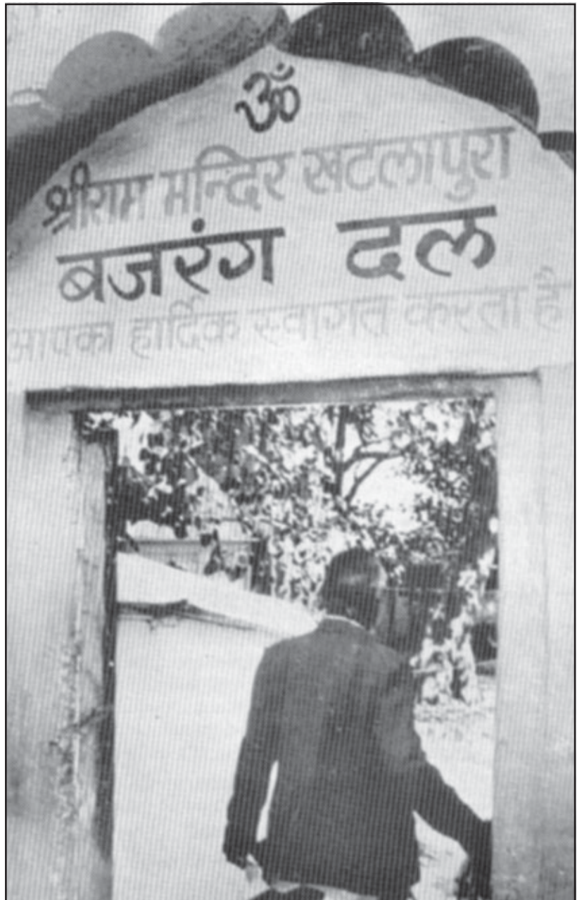
An example of a temple takeover. The writing at the entrance of a temple in Bhopal reads: Shri Ram Mandir Khatlapur, Bajranjg Dal extends a hearty welcome to you

Those of you who do not support them, are you all together or are there differences amongst you too?