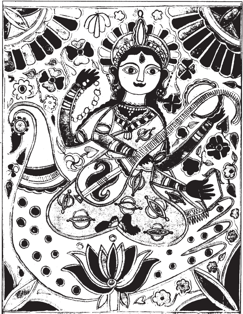
A Madhubani painting depicting Saraswati — The Goddess of learning

9 A very vigorous effort is also required to preserve our ancient monuments, including temples, as these are repositories of our cultural heritage. Most of them are being destroyed beyond repair due to systematic neglect. The looting and plundering of ancient temples by