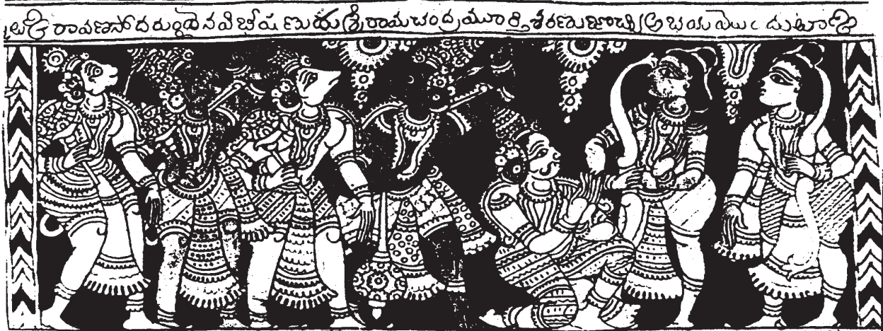
Vibhishana, Ravana's brother, goes over to Rama and is given asylum

In our time far more murders have been committed in the name of nationalism than for the sake of any religion. The two world wars are a prime example. The war between Iran and Iraq, both Muslim countries, which has killed millions of people, is its most recent manifestation. Chauvinist nationalism cannot sustain itself without the notion of a