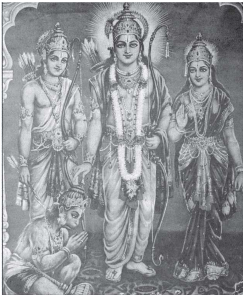
Many Indian homes are decorated with colourful renderings of Rama and Sita. This is a black and white reproduction of one that is popular

Reports of communal massacres from Bhagalpur, Ahmedabad, Gonda and elsewhere all testify to a pattern of fearful silence or aggressive