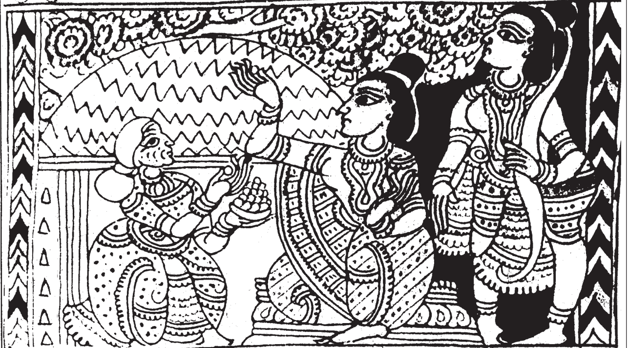
Sabari gives berries to Rama who eats them heartily to her great delight