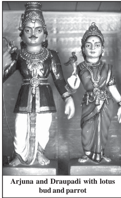
Arjuna and Draupadi with lotus bud and parrot

However, neither Madhavi nor Sharadandayani nor Kunti had to live out their lives adjusting repeatedly to a different husband from among five