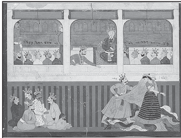
Disrobing Draupadi, Basholi 18th c. 19

“Our elders, learned in dharma , Drona and others, sit