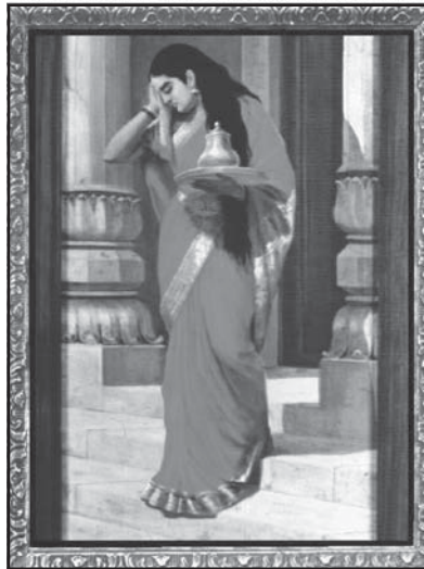
Draupadi going to Kichaka: Painting by Ravi Varma

The manner in which Draupadi manipulates Bhima to get what she wants is a fascinating lesson in the art and craft of sexual power. She does not turn to Arjuna, knowing him to be a true disciple of Yudhishtira as seen in the dice-game. Then Bhima alone had roared out his outrage. In