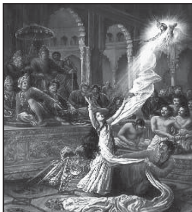
Kichaka insults Draupadi in court 14 : Painting by Ravi Varma

As women, both Kunti and Draupadi are singularly ill fated. Like her mother-in-law, Draupadi never enjoys possession of her first love. Kunti had chosen Pandu above all kings in the svayamvara ceremony and lost him to the voluptuous Madri. How deeply this pained her is voiced frankly as she finds Pandu lying dead in her co-wife's arms (I.125.23). Similarly, before Arjuna's turn came to be with Draupadi, he chose exile. Her anguish at losing him to Ulupi, Chitrangada and Subhadra in succession is expressed with moving abhimana , hurt self-image: