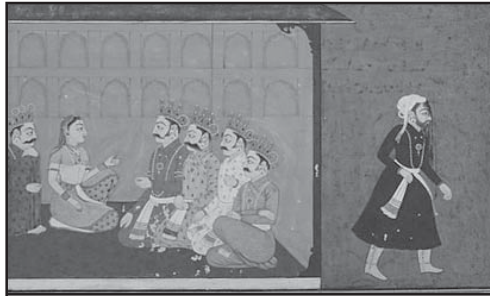
Draupadi, Pandavas, Ashvatthama

Draupadi is the only instance in epic mythology of a sati becoming a kanya . Addressing Krishna in anguish when they meet in the forest, she exclaims accusingly, “O Krishna, despite being a sati admired of women, I was, in the very presence of Pandu’s sons, O Madhusudana, dragged by my hair”